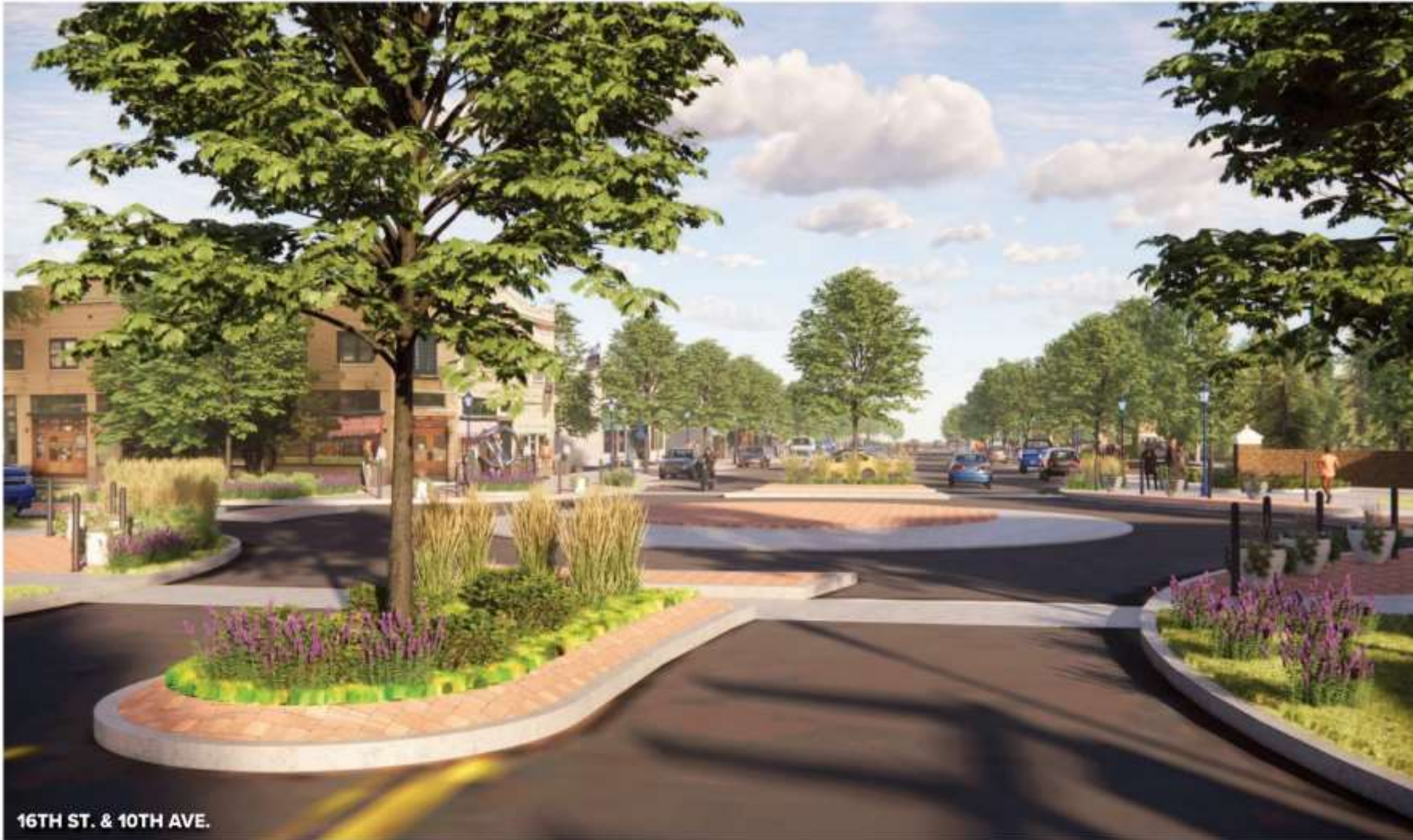
16TH ST. & 10TH AVE.