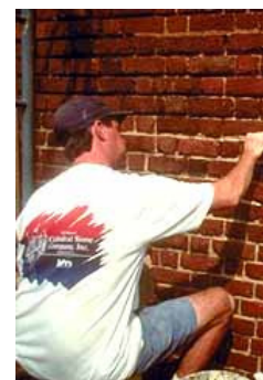
This early 19th century building is being repointed with lime mortar.

Permeability, or rate of vapor transmission, is also critical. High lime mortars are more permeable than denser cement mortars. Historically, mortar acted as a bedding material—not unlike an expansion joint—rather than a "glue" for the masonry units, and moisture was able to migrate through the mortar joints rather than the masonry units. When moisture evaporates from the masonry it deposits any soluble salts either on the surface as efflorescence or below the surface as subflorescence . While salts deposited on the surface of masonry units are usually relatively harmless, salt crystallization within a masonry unit creates pressure that can cause parts of the outer surface to spall off or delaminate. If the mortar does not permit moisture or moisture vapor to migrate out of the wall and evaporate, the result will be damage to the masonry units.