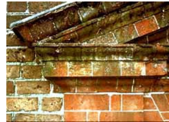
This 18th century pediment and surrounding wall exhibit distinctively different mortar joints.

Even with the best efforts at matching the existing mortar color, texture, and materials, there will usually be a visible difference between the old and new work, partly because the new mortar has been matched to the unweathered portions of the historic mortar. Another reason for a slight mismatch may be that the sand is more exposed in old mortar due to the slight erosion of the lime or cement. Although spot repointing is generally preferable and some color difference should be acceptable, if the difference between old and new mortar is too extreme, it may be advisable in some instances to repoint an entire area of a wall, or an entire feature such as a bay, to minimize the difference between the old and the new mortar. If the mortars have been properly matched, usually the best way to deal with surface color differences is to let the mortars age naturally. Other treatments to overcome these differences, including cleaning the non-repointed areas or staining the new mortar, should be carefully tested prior to implementation.