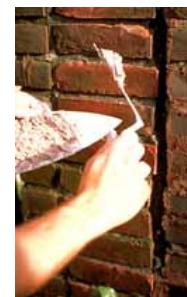
This mortar is the proper consistency for repointing historic brick.