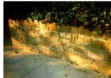
When repairing this stone wall, the mason matched the raised profile of the original tuckpointing.

The relationship of repointing to other work proposed on the building must also be recognized. For example, if paint removal or cleaning is anticipated, and if the mortar joints are basically sound and need only selective repointing, it is generally better to postpone repointing until after completion of these activities. However, if the mortar has eroded badly, allowing moisture to penetrate deeply into the wall, repointing should be accomplished before cleaning. Related work, such as structural or roof repairs, should be scheduled so that they do not interfere with repointing and so that all work can take maximum advantage of erected scaffolding.