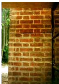
A mechanical grinder improperly used to cut out the horizontal joint and incompatible repointing have seriously damaged the 19th century brick.

Building managers also must recognize the difficulties that a repointing project can create. The process is time consuming, and scaffolding may need to remain in place for an extended period of time. The joint preparation process can be quite noisy and can generate large quantities of dust which must be controlled, especially at air intakes to protect human health, and also where it might damage operating machinery. Entrances may be blocked from time to time making access difficult for both building tenants and visitors. Clearly, building managers will need to coordinate the repointing work with other events at the site.