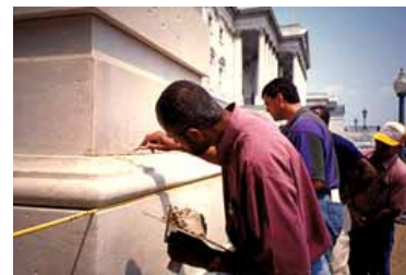
Masons practice using lime putty mortar to repair historic marble.

Because there are so many possible causes for deterioration in historic buildings, it may be desirable to retain a consultant, such as a historic architect or architectural conservator, to analyze the building. In addition to determining the most appropriate solutions to the problems, a consultant can prepare specifications which reflect the particular requirements of each job and can provide oversight of the work in progress. Referrals to preservation consultants frequently can be obtained from State Historic Preservation Offices, the American Institute for Conservation of Historic and Artistic Works (AIC), the Association for Preservation Technology (APT), and local chapters of the American Institute of Architects (AIA).