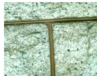
This late 19th century granite has recently been repointed with the joint profile and mortar color carefully matched to the original.

The drawback of most mortar analysis methods is that mortar samples of known composition have not been analyzed in order to evaluate the method. Historic mortars were not prepared to narrowly defined specifications from materials of