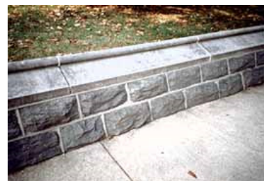
Caulking was inappropriately used here in place of mortar on the top of the wall. As a result, it has not been durable.

Lime, itself, when mixed with water into a paste is very plastic and creamy. It will remain workable and soft indefinitely, if stored in a sealed container. Lime (calcium hydroxide) hardens by carbonation absorbing carbon dioxide primarily from the air, converting itself to calcium carbonate. Once a lime and sand mortar is mixed and placed in a wall, it begins the process of carbonation. If lime mortar is left to dry too rapidly, carbonation of the mortar will be reduced, resulting in poor adhesion and poor durability. In addition, lime mortar is slightly water soluble and thus is able to re-seal any hairline cracks that may develop during the life of the mortar. Lime mortar is soft, porous, and changes little in volume during temperature fluctuations thus making it a good choice for historic buildings. Because of these qualities, high calcium lime mortar may be considered for many repointing projects, not just those involving historic buildings.