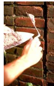
Soft mortar for repointing.

Masonry—brick, stone, terra-cotta, and concrete block—is found on nearly every historic building. Structures with all-masonry exteriors come to mind immediately, but most other buildings at least have masonry foundations or chimneys. Although generally considered "permanent," masonry is subject to deterioration, especially at the mortar joints. Repointing, also known simply as "pointing" or—somewhat inaccurately—"tuck pointing"*, is the process of removing deteriorated mortar from the joints of a masonry wall and replacing it with new mortar. Properly done, repointing restores the visual and physical integrity of the masonry. Improperly done, repointing not only detracts from the appearance of the building, but may also cause physical damage to the masonry units themselves.