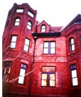
Unskilled repointing has negatively impacted the character of this late-19th century building.

These panels are prepared by the contractor using the same techniques that will be used on the remainder of the project. Several panel locations—preferably not on the front or other highly visible location of the building—may be necessary to include all types of masonry, joint styles, mortar colors, and other problems likely to be encountered on the job.