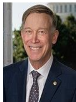
US Senator John Hickenlooper 801 8 th Street, Suite 140A Greeley, CO 80631 (970) 352-5546