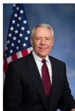
Congressman Ken Buck 5626 19th Street, Suite A Greeley, CO 80631 (970) 352-5546