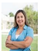
Congresswoman Yadira Caraveo