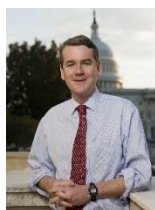
US Senator Michael Bennet 1200 S College Ave, Suite 211 Fort Collins, CO 80524 (970) 224-2200