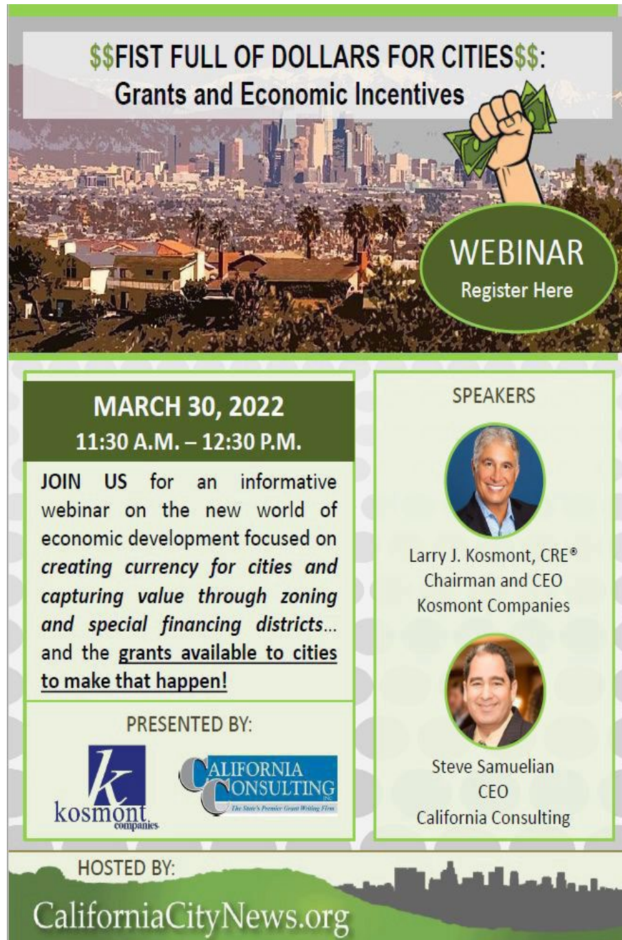
Exhibit 3 – Webinar and Workshop Fliers