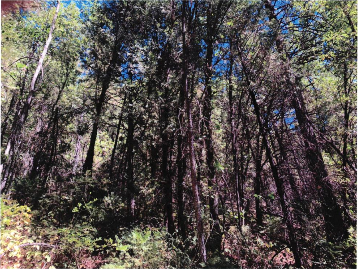
View of Grass Valley easement on Pine Creek Shopping Center property taken from the Wolf Creek Trail on Sept. 13, 2024