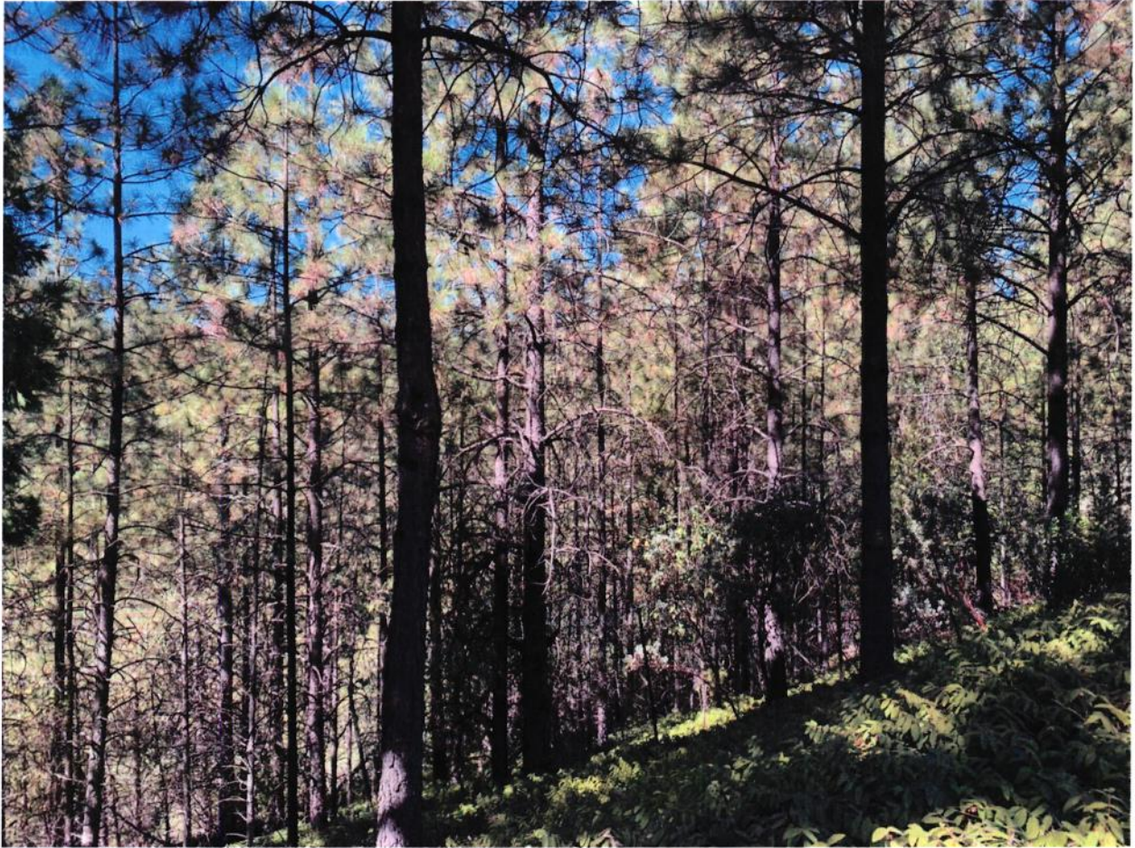
View of Grass Valley easement on Pine Creek Shopping Center property taken from behind Raley's on Sept. 8, 2024