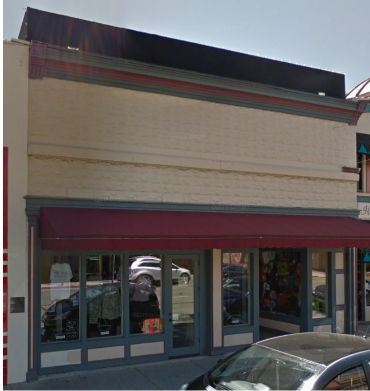
Existing storefront façade