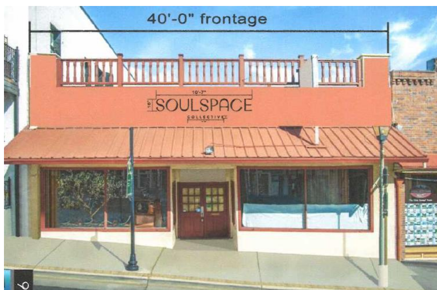
Proposed Above-Awning Sign

This Minor Sign Review permit is for a proposed “Soulspace Collective” wall-mounted sign above the existing canopy. The “Soulspace” lettering measures 10 feet, 7 inches in length by 18 inches in height, and “Collective” measures 4 feet, 3 inches in length and 4 inches in height, for a total square footage of approximately 17.022 square feet. The sign will be centered on the building, above the front door. The sign will be composed of individual aluminum letter that are \frac{3}{4} inches thick and painted black.