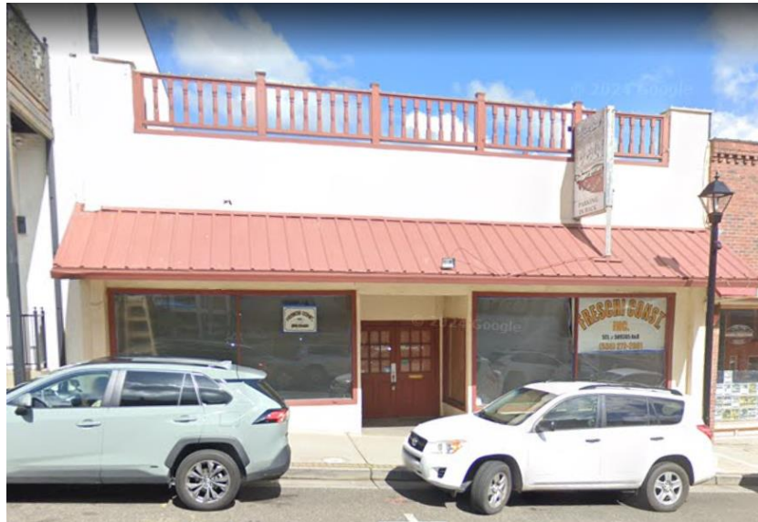
Existing storefront façade

suspended from the canopy was recently approved for Souldspace Collective at this space with an area of 7.875 square feet.