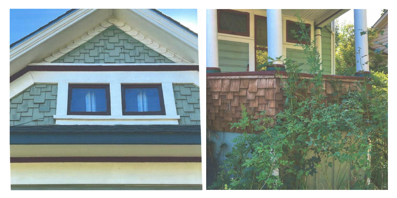
Existing Shingled Siding at 257 South Auburn Street

Today, the façade of the building at 257 South Auburn Street is identical to the image recorded at the time of the historical inventory. However, the shingles are shake shingles rather than fish-scale shingles.