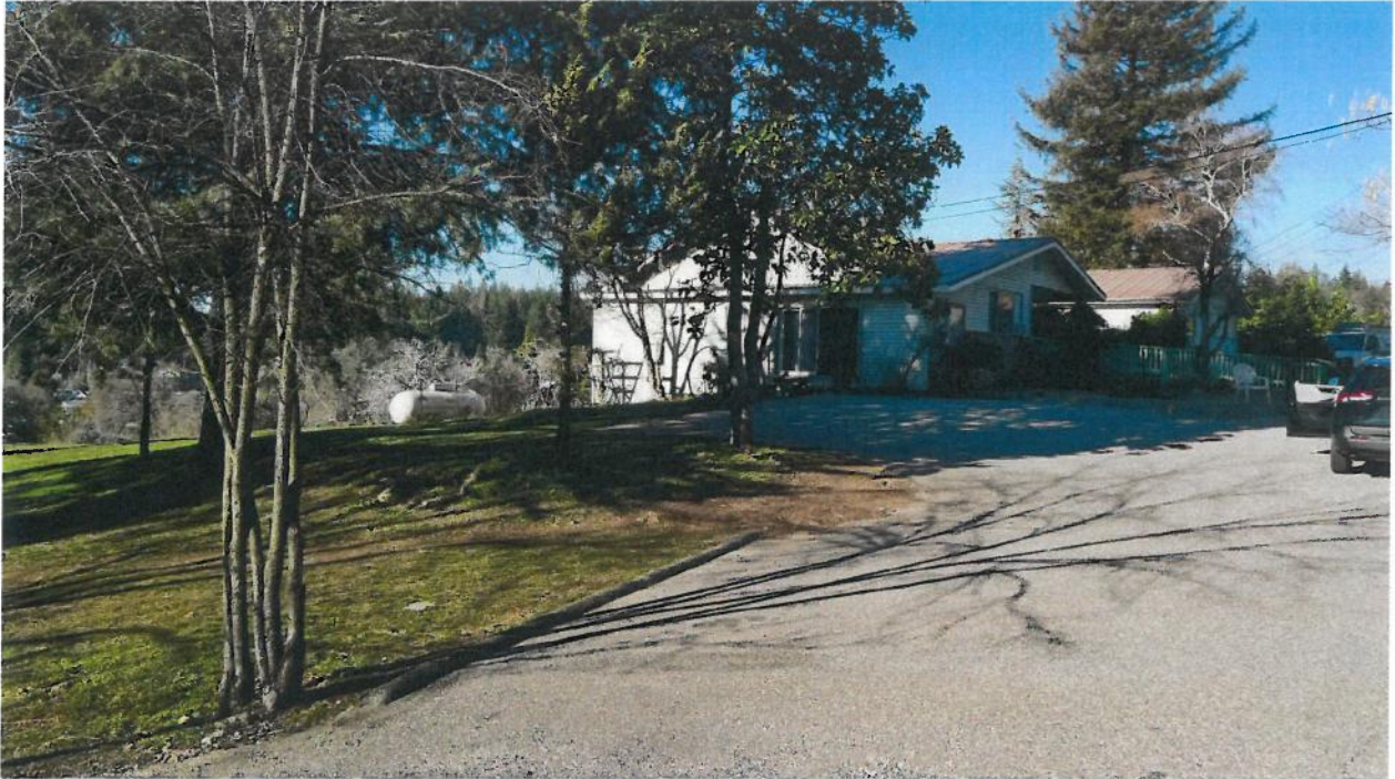
View from driveway near Gates Place