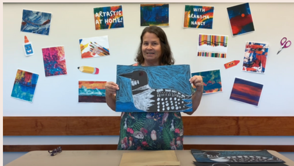
Artastic at Home