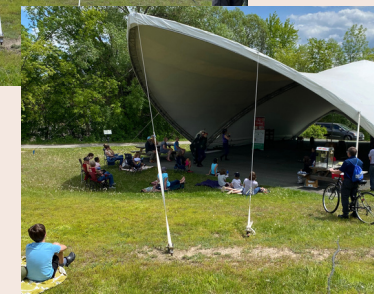
Taiko Arts Midwest