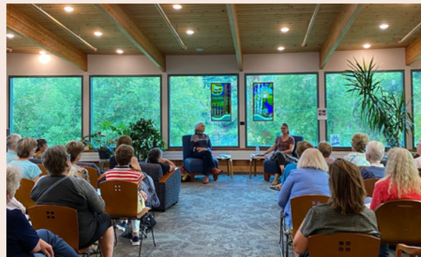
Road Tripping Writers