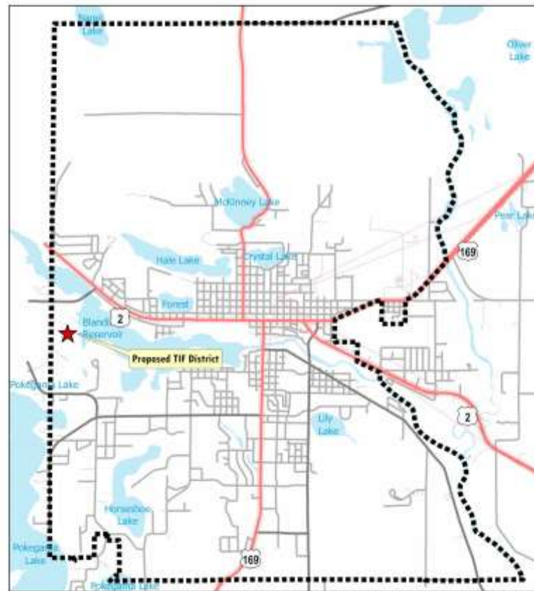
Map of City Development District