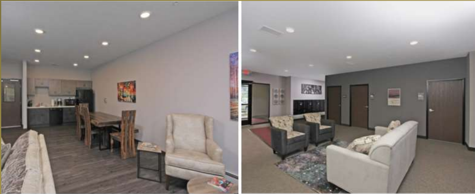
Interior Finish Examples