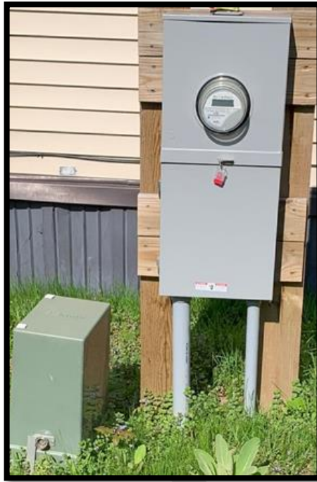
Figure 1: Ped with Meter base.

Examples of standard (to be used as a guide):