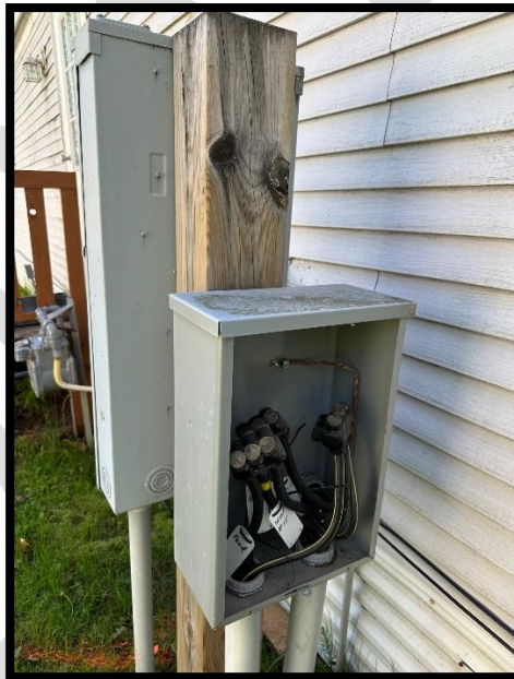
Figure 2: Junction Box with Meter Base