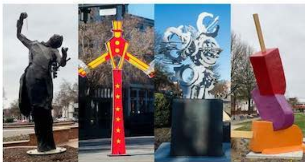
Pieces of Augusta's Sculpture Trail entitled, left to right, "Maestro", "Unstoppable", "Orion", and "Popsicles".

The Augusta Sculpture Trail has been a four-month project by the Greater Augusta Arts Council and consists of 11 sculptures, two of which are part of a set, spread out across the downtown Augusta area.