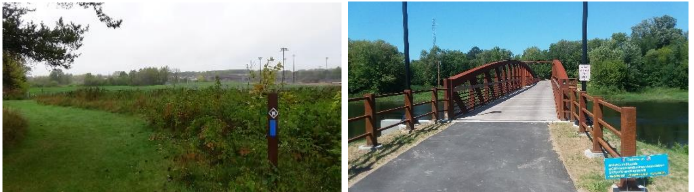
Trail between the Grand Itasca Clinic and Forest History Center; the trail near Pine Ridge Drive