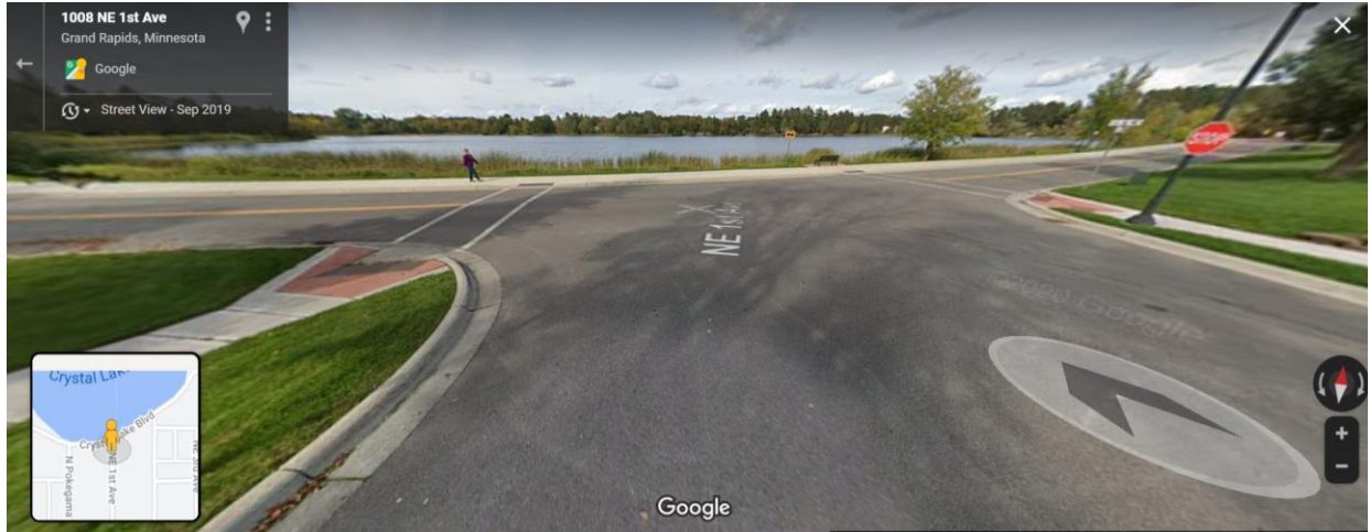
Looking North from the intersection of NE 1 st Ave. and Crystal Lake Blvd.