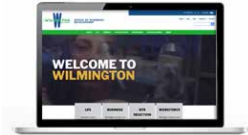
City of Wilmington (DE) Office of Economic Development