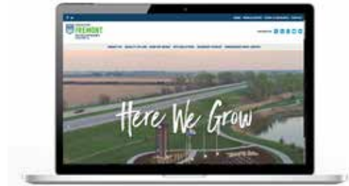
Greater Fremont (NE) Development Council