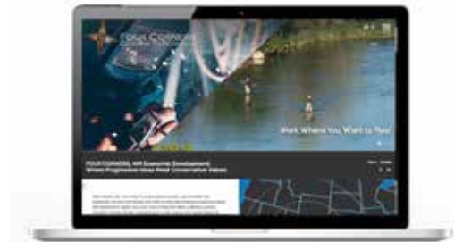
Four Corners (NM) Economic Development