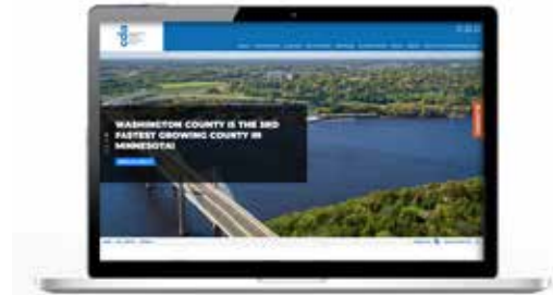
Washington County (MN) Community Development Agency