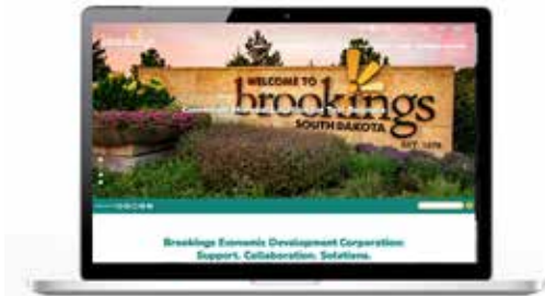
Brookings (SD) Economic Development Corporation