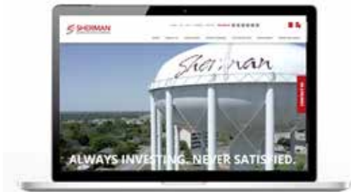
Sherman (TX) Economic Development Corporation