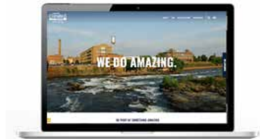
Greater Columbus (GA) Chamber Economic Development