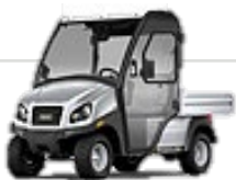
Street Legal (LSV)