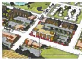
Alternate 1: Hotel

The 1.5-acre former Itasca County Farm Service site has the potential to spur a multi-phase commercial development along the southern edge of Highway 2. A new commercial use could leverage extending 10th Avenue to the north, while adding intersection improvements at the Highway 2 and 10th Avenue intersection.