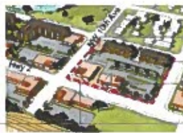
Alternate 2: Commercial Frontage