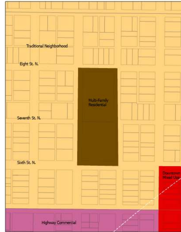
Forest Lake Addition Rezoning Comprehensive Plan Future Land Use Map

*It should be noted that the Future Land Use Map is intended to show the long-range desired future condition of an area, on a generalized basis, and is less geographically specific.