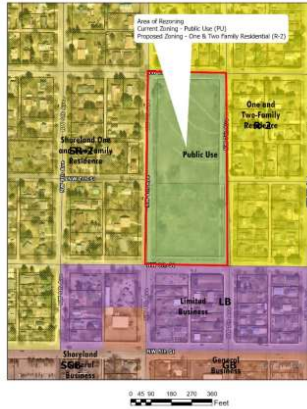
Forest Lake Addition Rezoning Surrounding Zoning

R-2 (One and Two Family Residential) adjacent to the east and north, SR-2 (Shoreland One and Two Family Residential) to the west. LB (Limited Business) to the south.