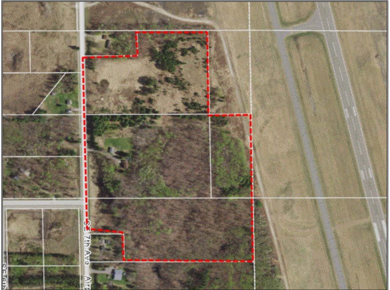
Figure 2. Recent Aerial Photograph of Site Conditions

As shown in Figure 2, the bulk of the site is densely wooded with mature trees. From our previous experiences on this site, a significant amount of tree clearing will be needed in order to access the proposed soil boring locations. We have included an alternate cost to subcontract that service. Otherwise, we assume that services will be coordinated by you.