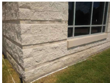
3 A2.01 TRIPLEX LEFT-SIDE ELEVATION - SAMPLE OF SPLIT-CMU & BRICK TRIM SCALE: NTS