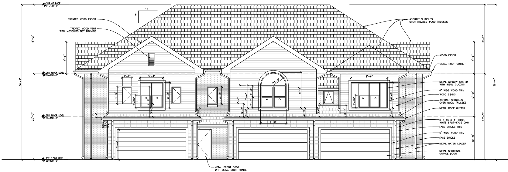
1 A2.01 TRIPLEX: FRONT ELEVATION - 80% MASONRY; 20% WOOD SIDING SCALE: 1/4" = 1'-0"