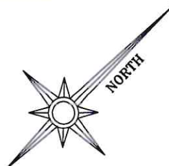
EXHIBIT MAP OF 1.543 ACRE OF LAND LOCATED IN THE JOSEPH STEWART SURVEY, ABSTRACT No. 961, ELLIS COUNTY, TEXAS