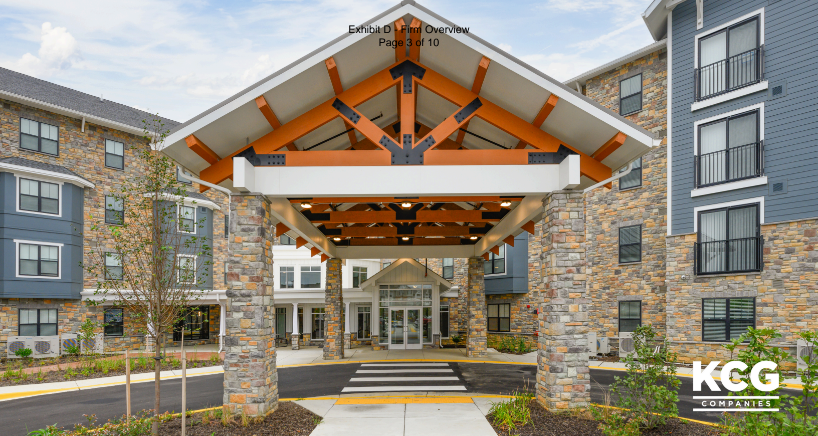
(above and below) Phases of the construction process at Hill House at Beechfield, our community in Bowie, MD designed for Adults 62+.