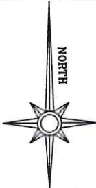
EXHIBIT MAP OF 0.053 ACRES OF LAND LOCATED IN THE J.D. ELLIS SURVEY, ABSTRACT No. 1274, AND THE JOSEPH STEWART SURVEY, ABSTRACT No. 961, ELLIS COUNTY, TEXAS