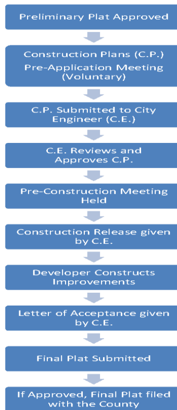
Figure 10.05 Construction Plan Process