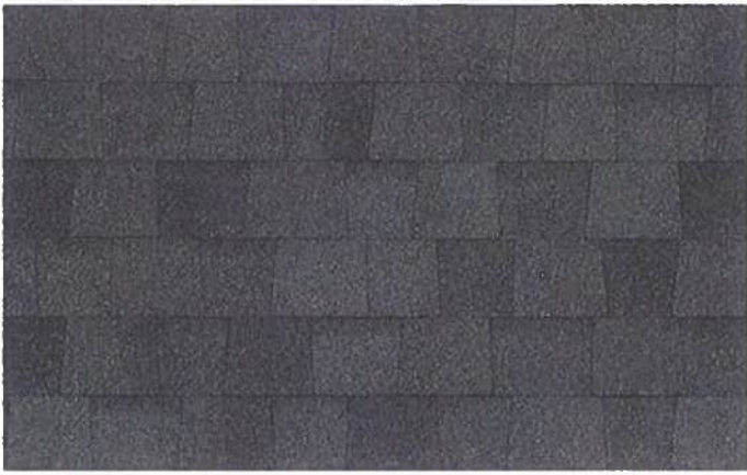
Moire Black Shingle that will we used