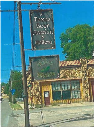
Old Sign. Replace with new metal sign. Logo cut out with green metal in between to make logo green