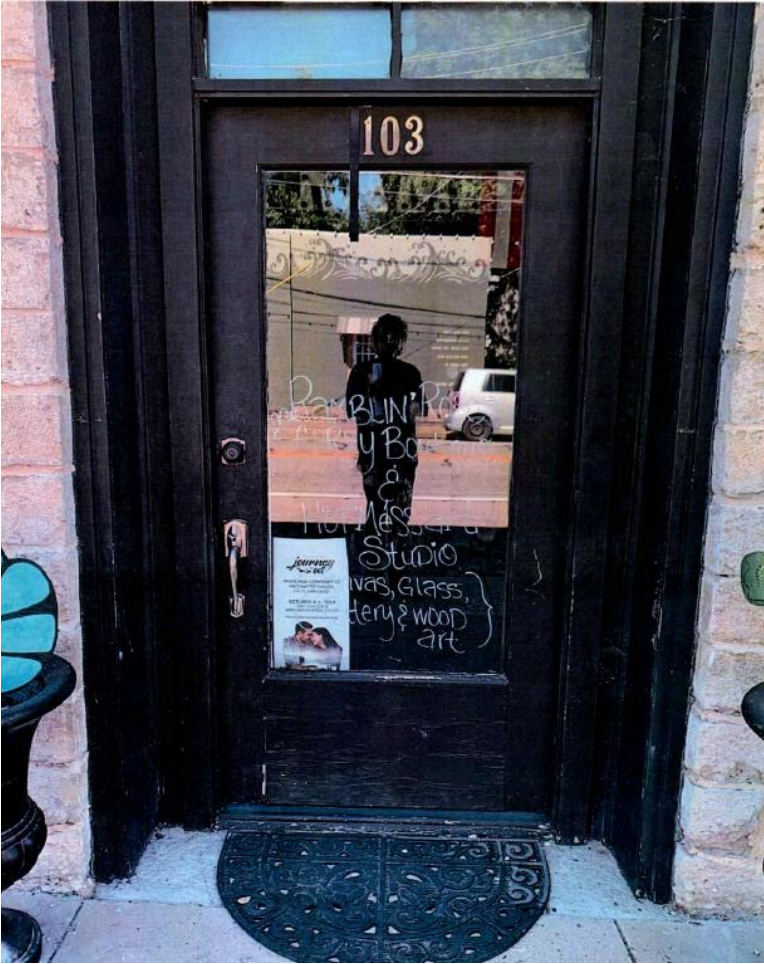
Current Picture 09.2024

Replace the front and back doors with the same doors to be painted Noir.