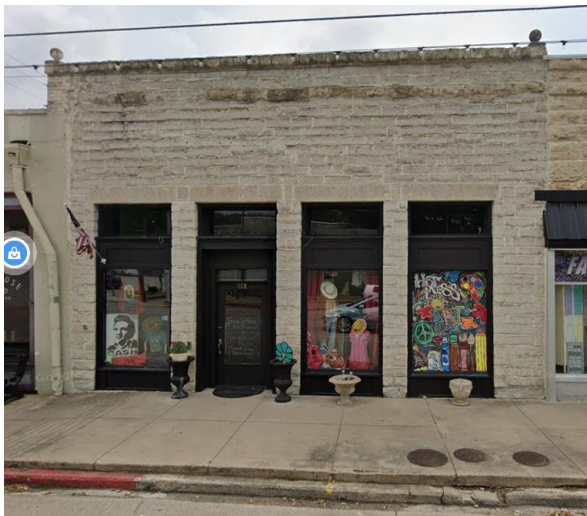
Current Picture 09.2024