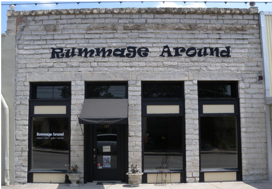
Resource Survey: April 2010