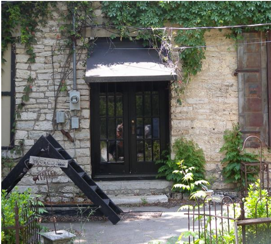
Resource Survey: April 2010