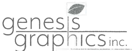
Vector graphic when enlarged.

Vector graphics are built out of math formulas that the computer translates into an image. Because they are formula based, their size is able to be adjusted endlessly without any loss of image or print quality.