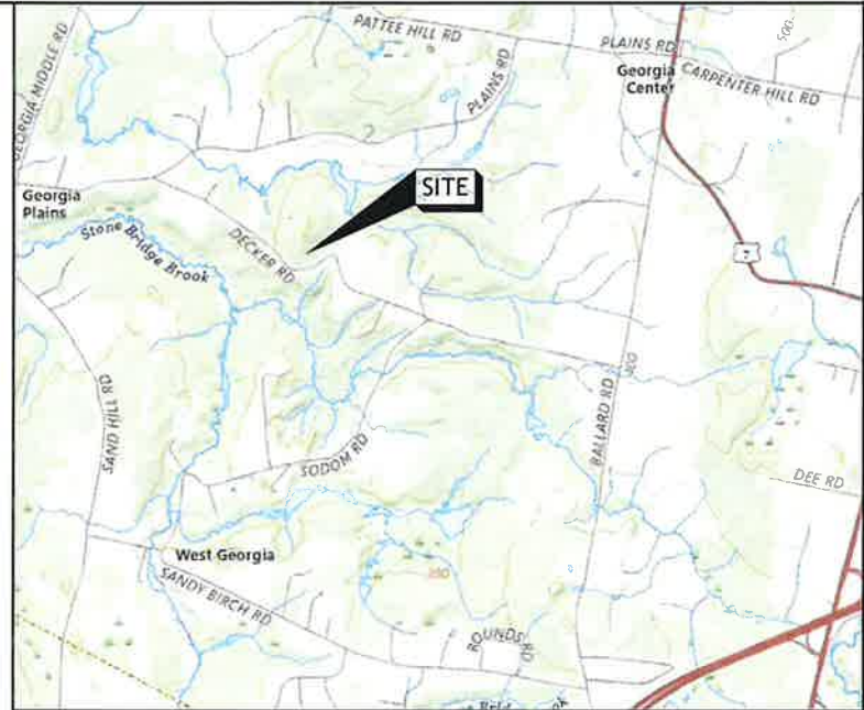
LOCUS MAP NOT TO SCALE