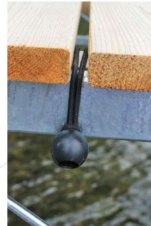
DOCK PANEL SECURING CORD