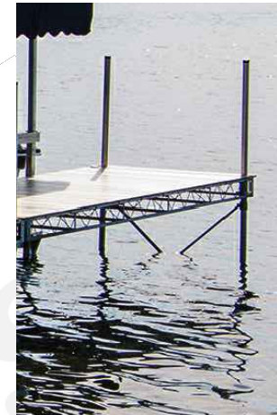
GALVANIZED CROSS BRACES