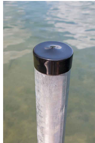
SAFETY CAP FOR 3" LEG PIPE