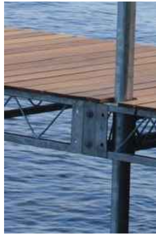
MEGA DUTY STEEL TRUSS CONN. BRACKET