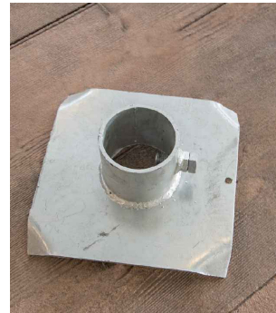
MEGA DUTY STEEL TRUSS FOOTPAD