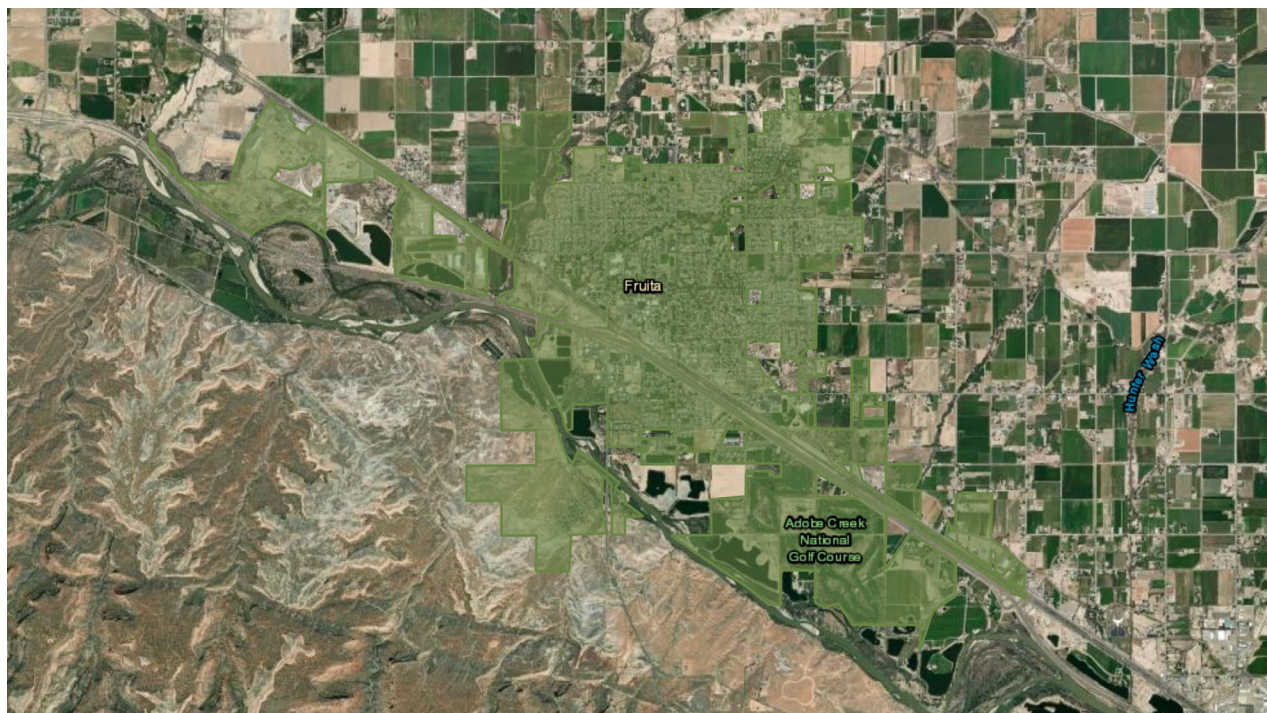
Figure A1: Fruita Municipal Boundary

Impact fees are based on the need for growth-related capital improvements, and they must be proportionate by type of land use. The demographic data and development projections are used to demonstrate proportionality and to anticipate the need for future infrastructure. Demographic data reported by the U.S. Census Bureau, and data provided by Fruita staff, are used to calculate base year estimates and annual projections for a 10-year horizon. Impact fee studies typically look out five to ten years, with the expectation that fees will be updated every three to five years.