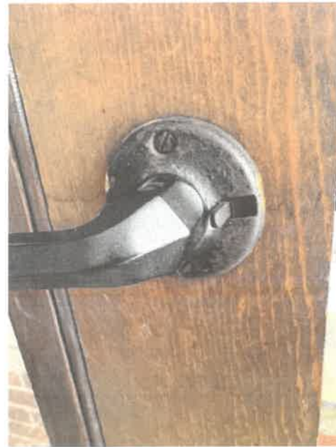
Figure 4. View of Structurally Compromised Storm Door