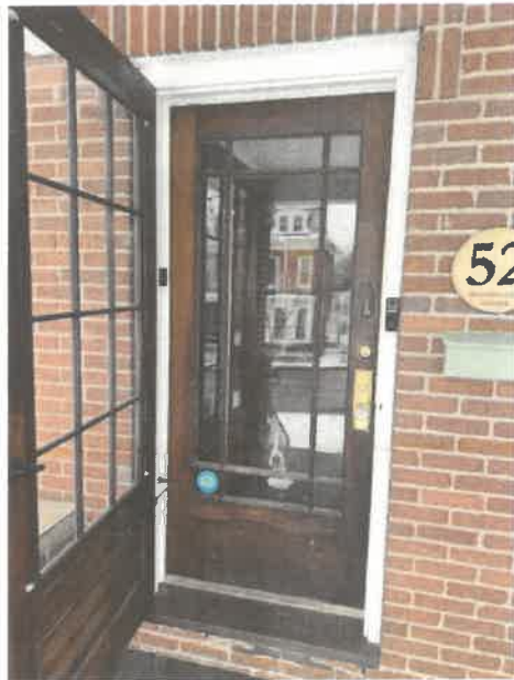
Figure 3. Storm and Main Door