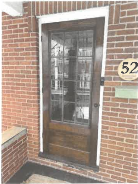
Figure 1. Existing Entryway