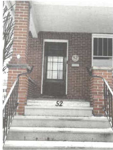
Figure 2. Entryway Street View