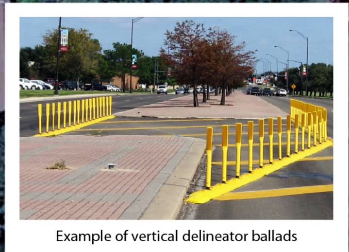
Example of vertical delineator bollards