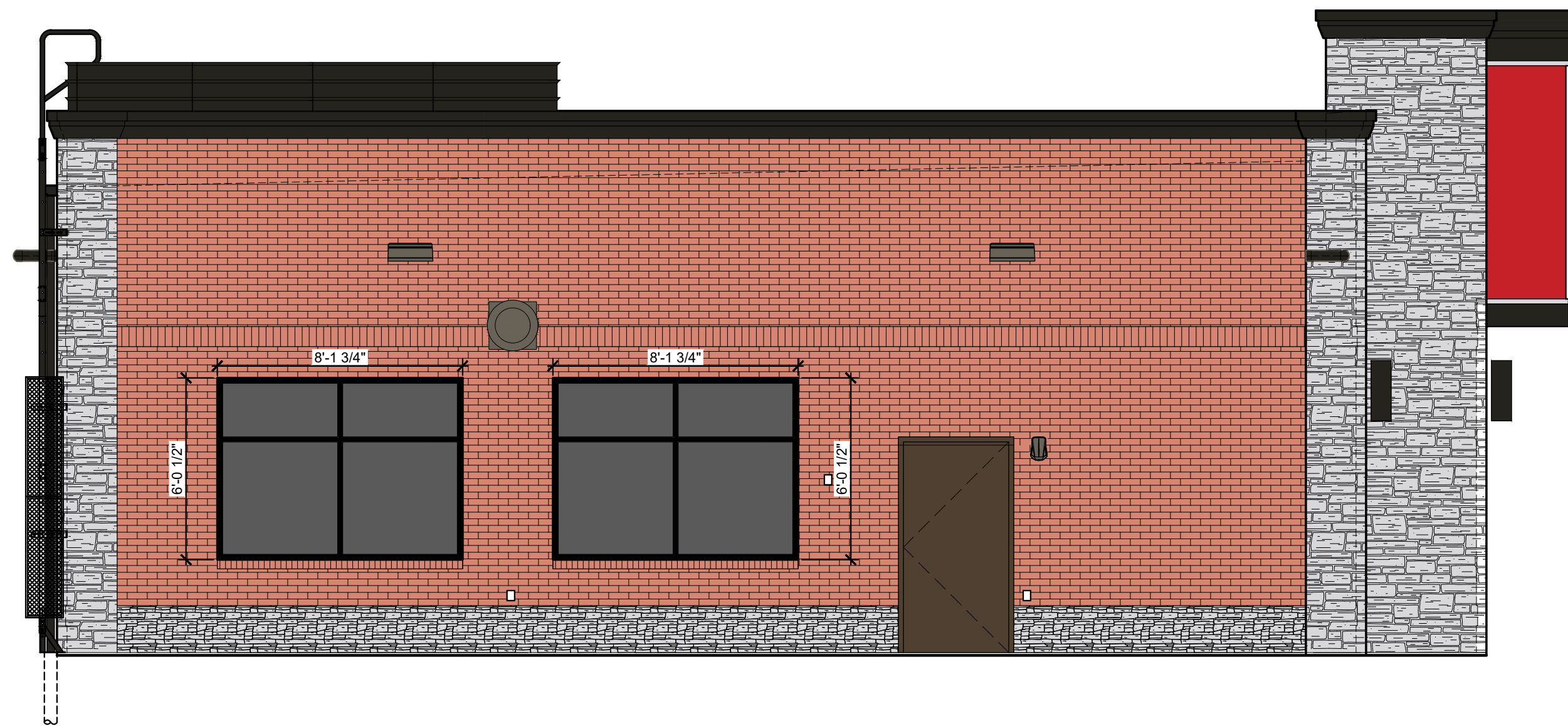
2 Exterior Elevation - Left Side of Building 1/4"=1'-0"