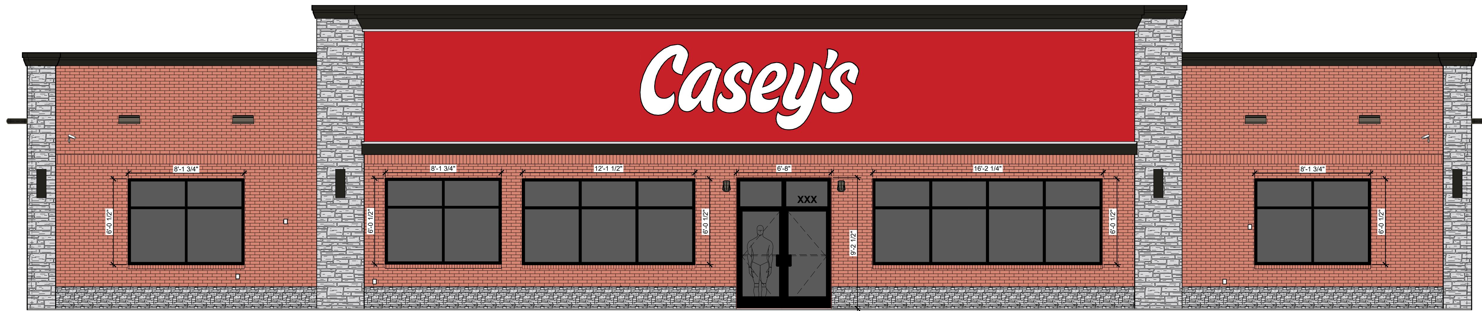
1 Exterior Elevation - Front of Building 1/4"=1'-0"