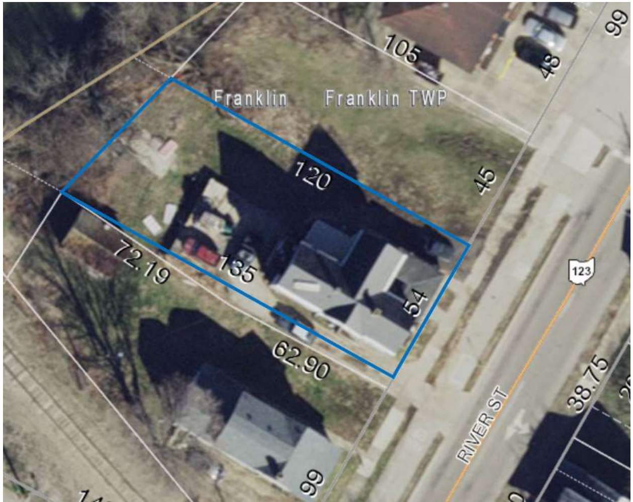
EXHIBIT A (Depiction of Property)