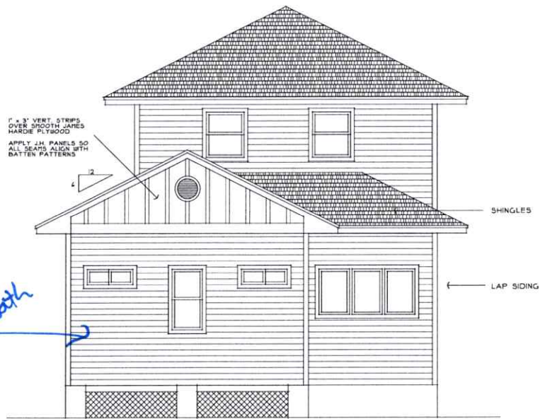
Proposed Front Elevation Scale : 1/4"=1'-0"