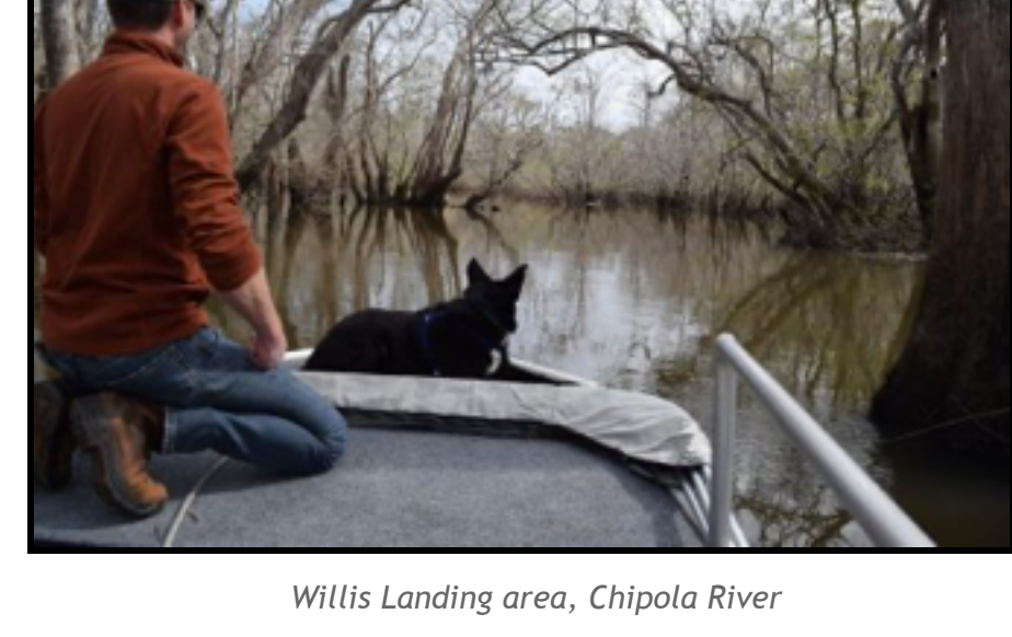
Willis Landing area, Chipola River