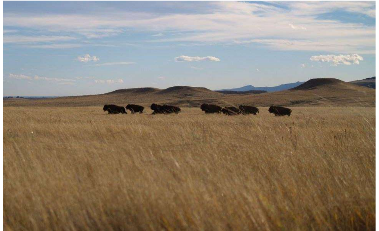
Bison release at Soapstone