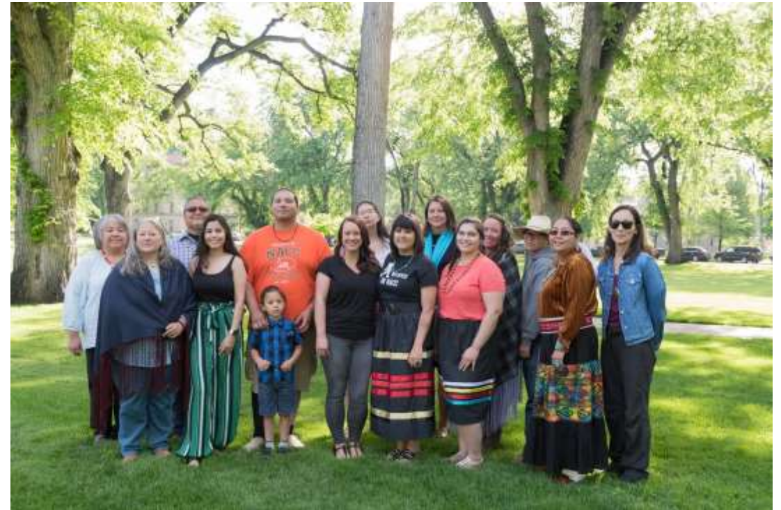
Members of the CSU Native community