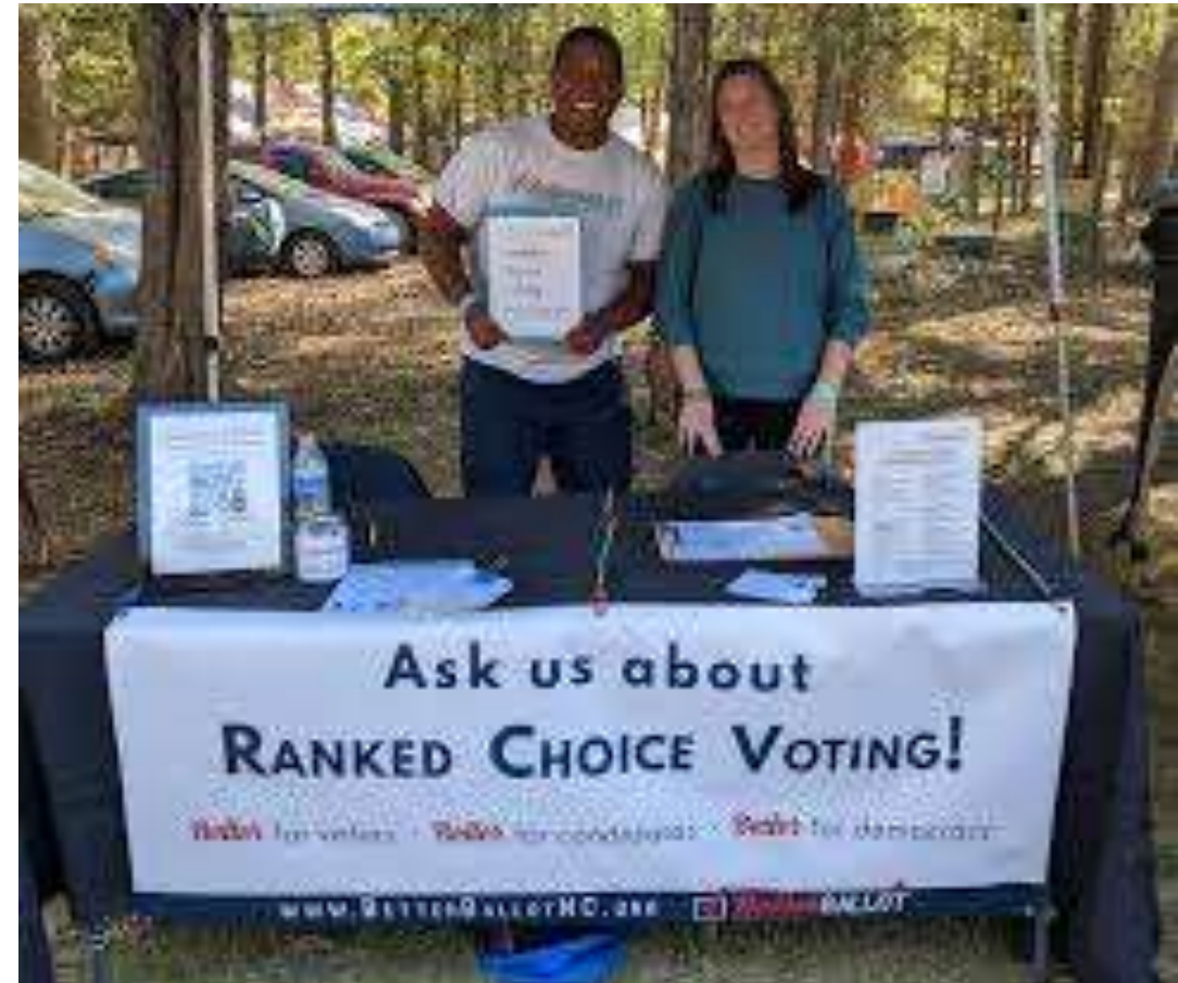
Better Ballot North Carolina