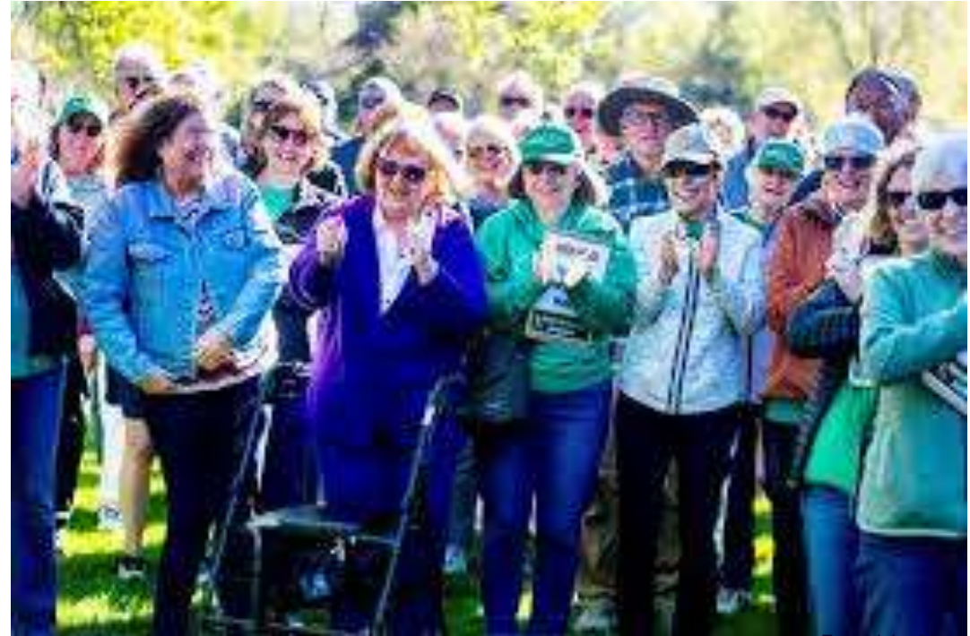
East Idaho News