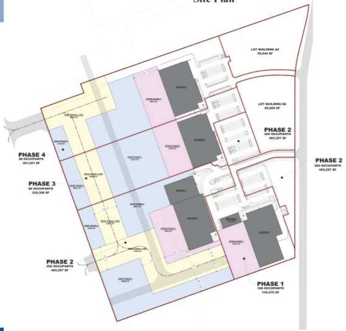
Exhibit "B1" Site Plan