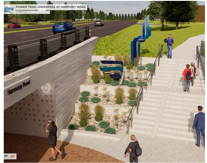
Renderings of proposed art installations Custodes Solis (Guardians of the Sun) and Motus Aquae (Movement of Water) by artist Todd Kundla, shown on the south and north sides of Harmony Road and Power Trail crossing, respectively.

The Power Trail & Harmony Road Crossing Project will complete a missing gap in the Power Trail at this busy intersection by building a pedestrian underpass beneath Harmony Road. Fort Collins APP Artist Todd Kundla was selected through an RFQ process and collaborated with the Project Team to develop artwork for this site.