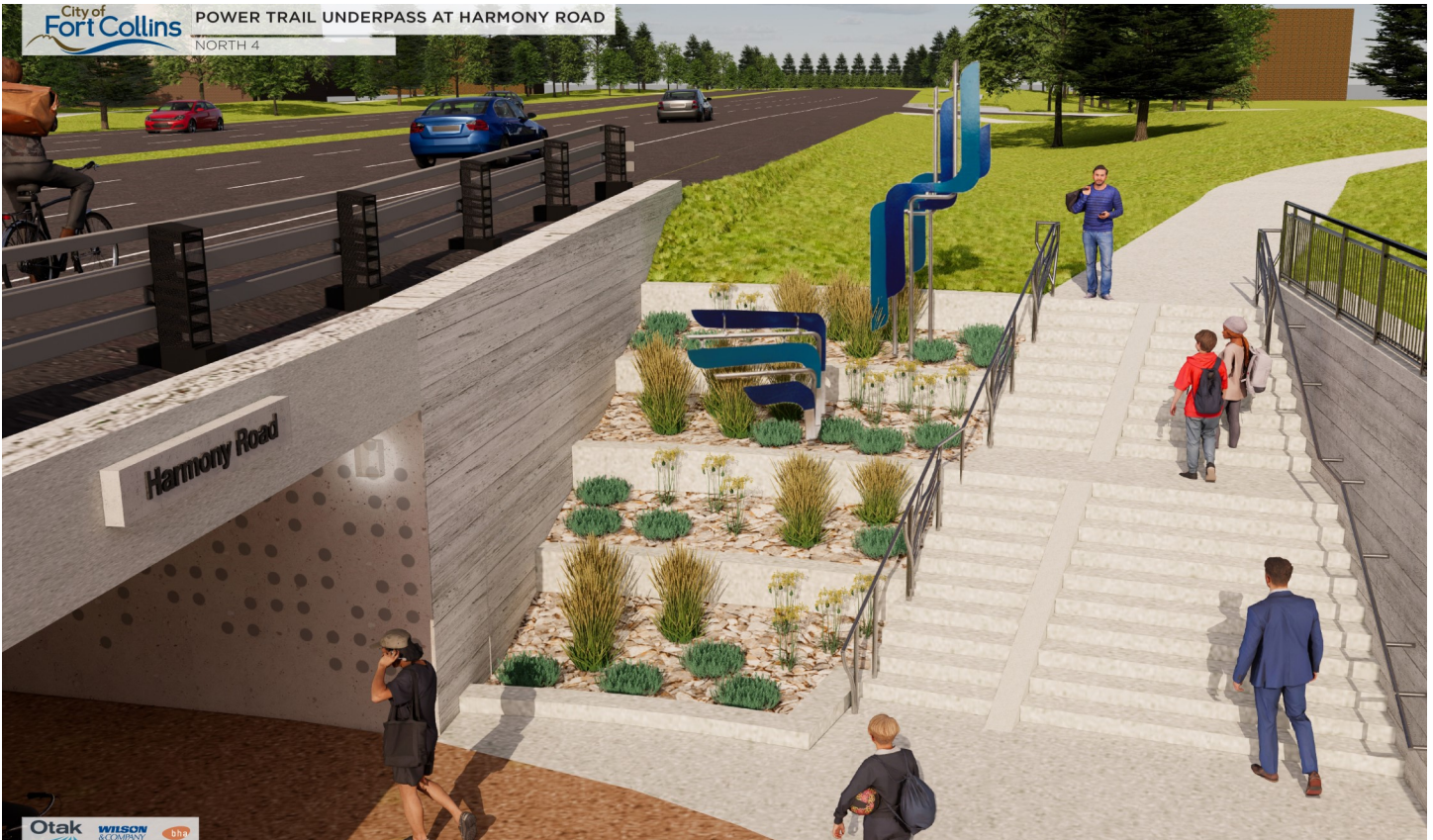
East elevation rendering of Motus Aquae (Movement of Water) by artist Todd Kundla . 8' x 12' x 12' with 3" x 6" steel rectangular tubing, oxidized finish, 1/2" thick polycarbonate colored panels (7x stronger than glass)