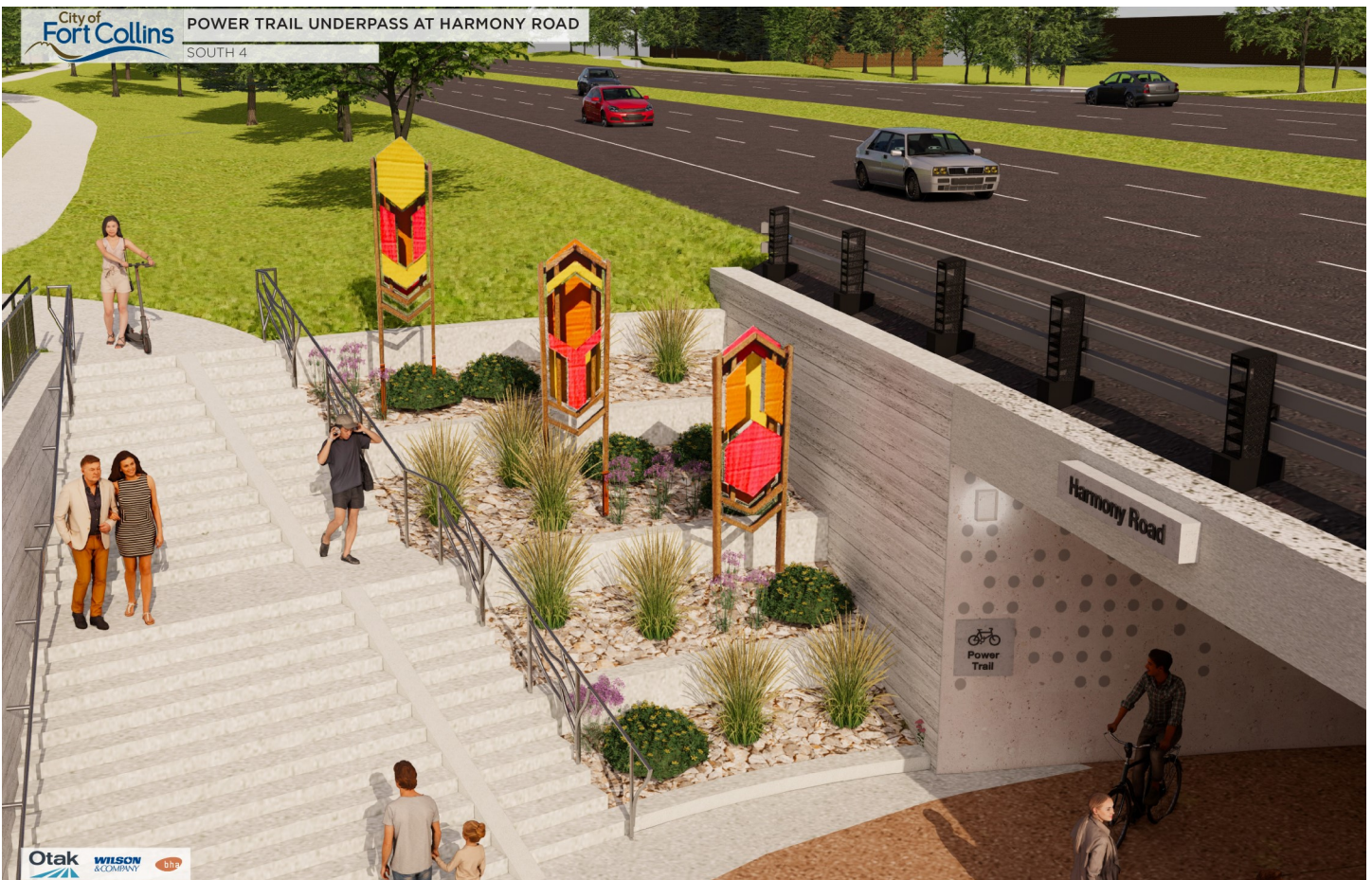
East elevation rendering of Custodes Solis (Guardians of the Sun) by artist Todd Kundla. 8' x 8' x 16' with 3" diameter steel tubing, 1/4" wall thickness, silver paint, 1/2" thick polycarbonate colored panels