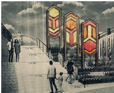
Custodes Solis by artist Todd Kundla