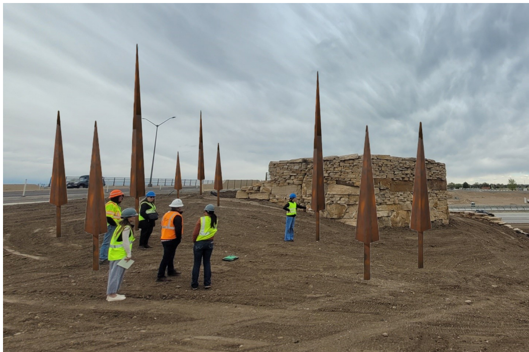
Proposed location of south trees