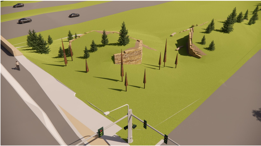
Aerial view of south trees