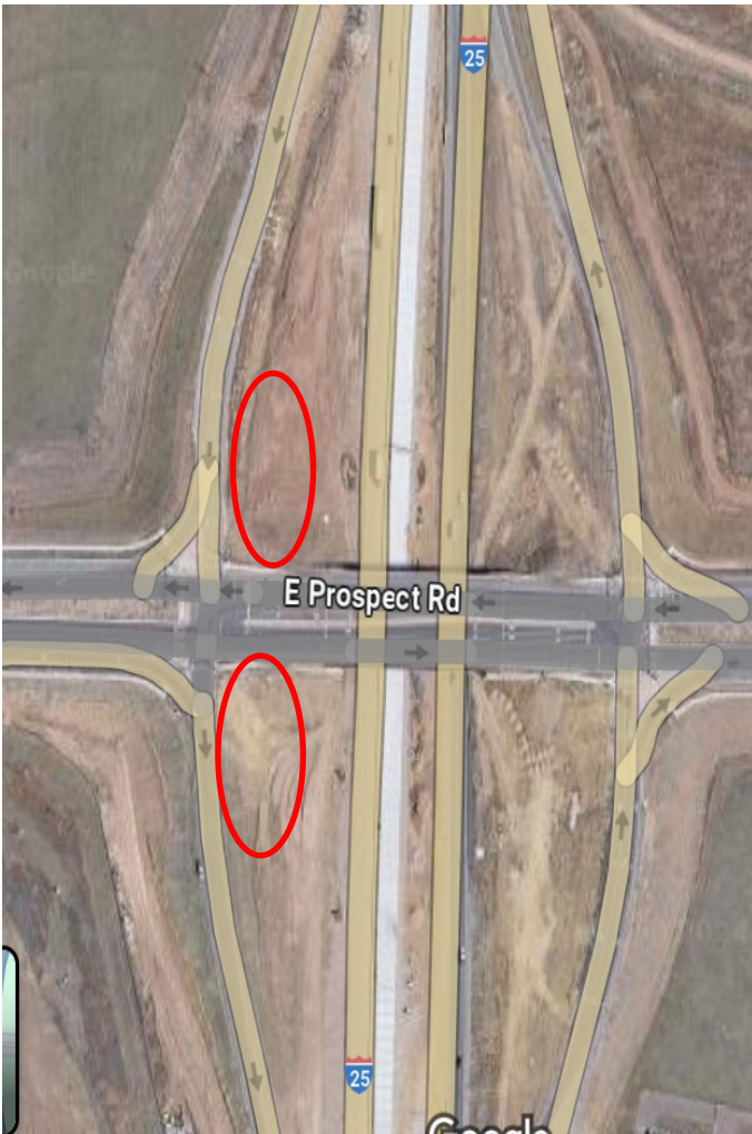
Proposed artwork locations: west of I25 adjacent to both the northbound and southbound ramps.