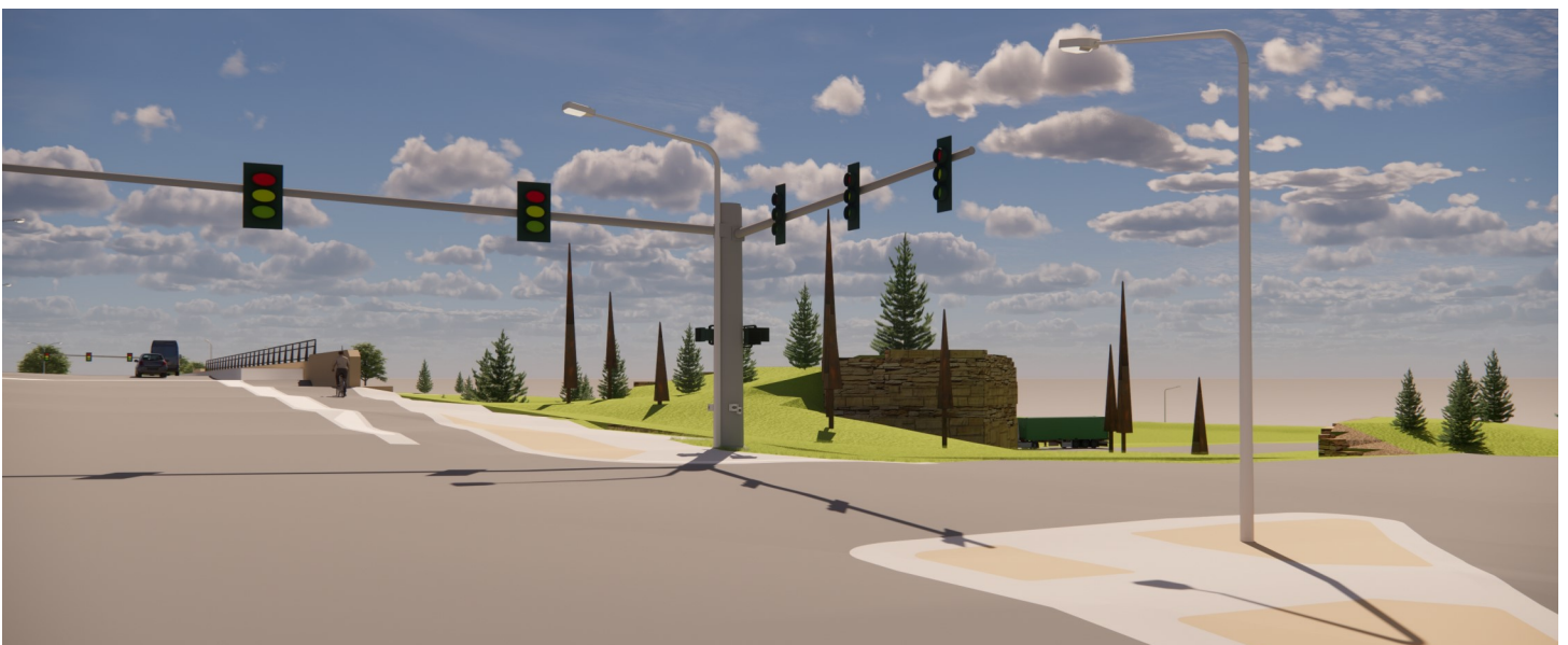
On Prospect, Just west of the interchange and looking southeast.

MAINTENANCE: Minimal care and maintenance is required on the work proposed here as durable materials will be used. An annual cleaning is recommended to keep the artwork looking its best. A rich warm orange- brown patina will naturally occur on the CorTen steel.