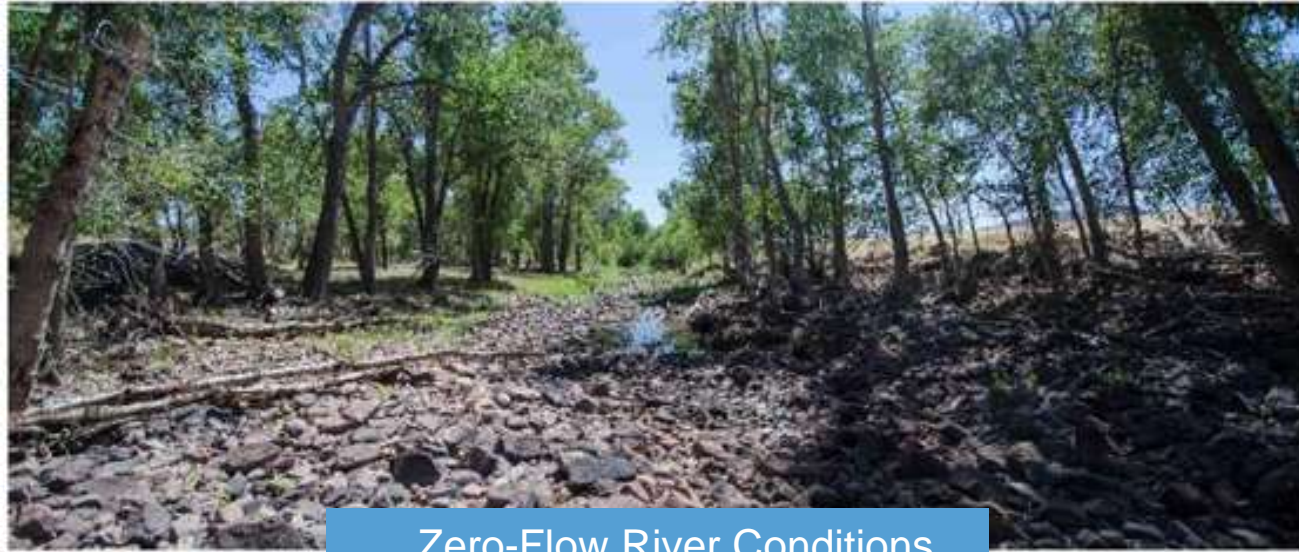
Zero-Flow River Conditions