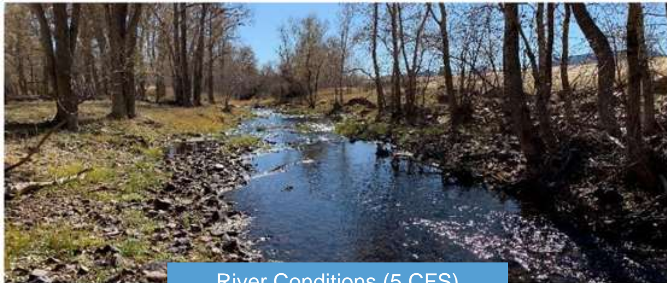
River Conditions (5 CFS)