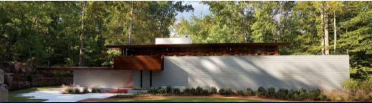
Bachman-Wilson House (Frank Lloyd Wright) at Crystal Bridges Museum in Bentonville, AR