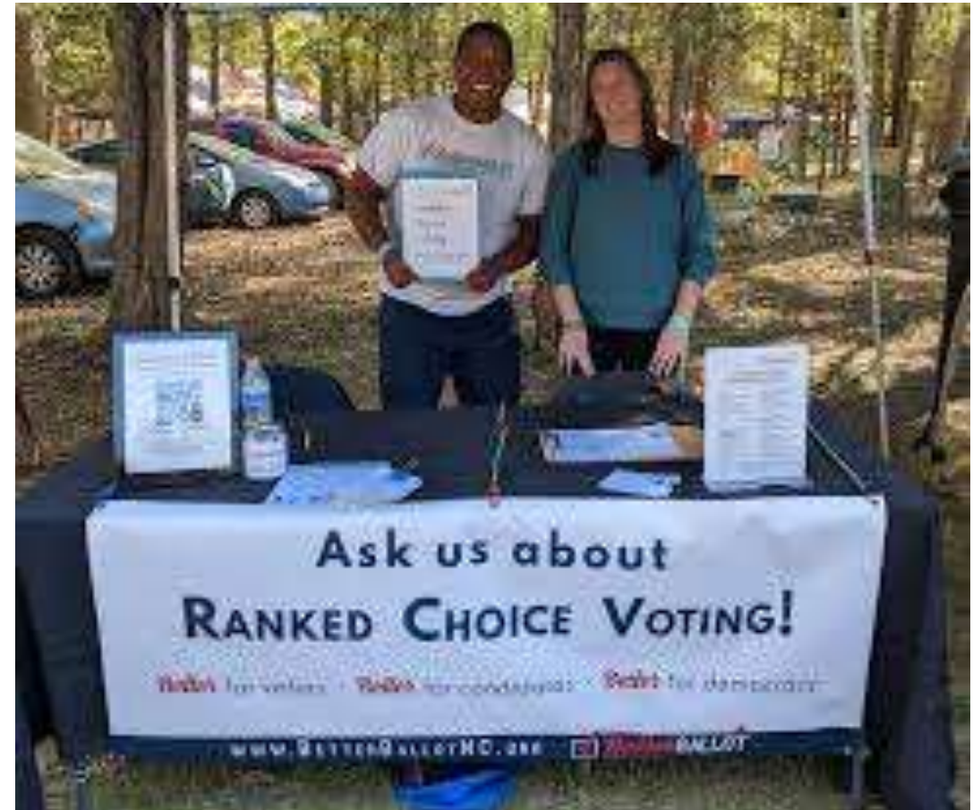
Better Ballot North Carolina