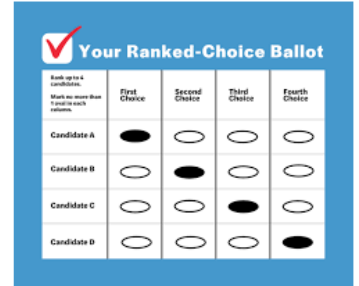
New Jersey State Bar