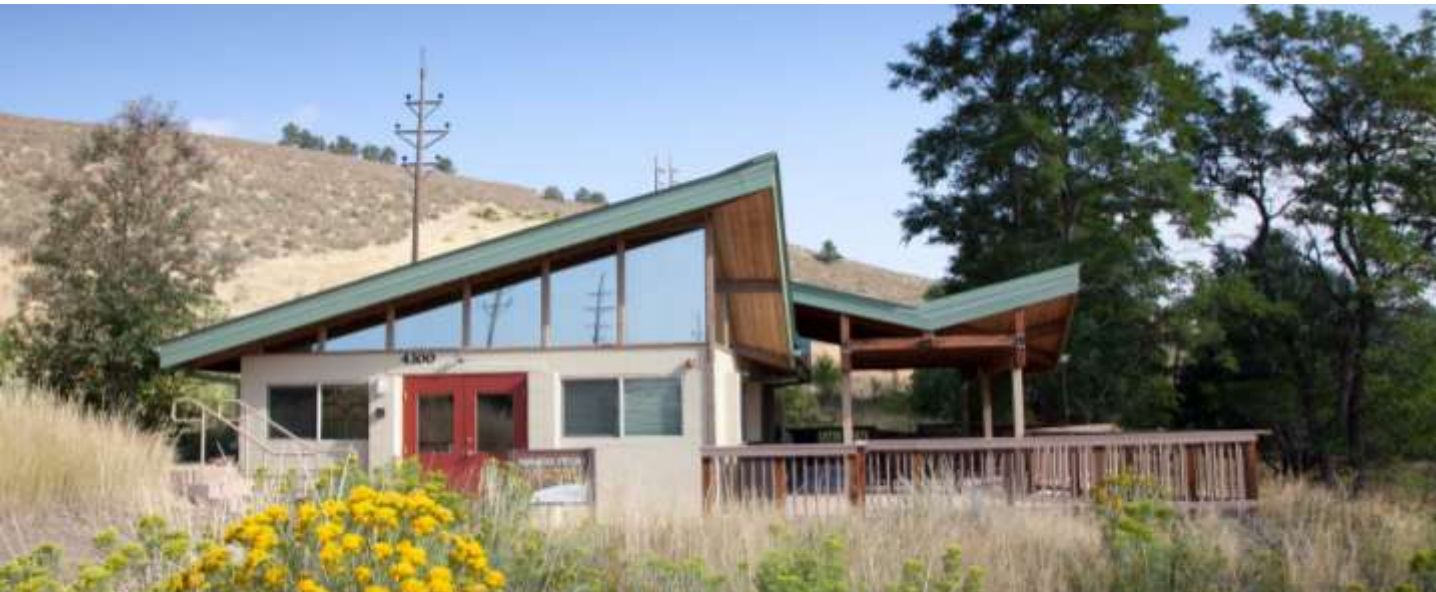
Primrose Studio Reservoir Ridge Natural Area