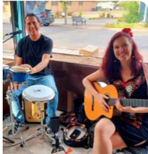
Social & Cultural Connector