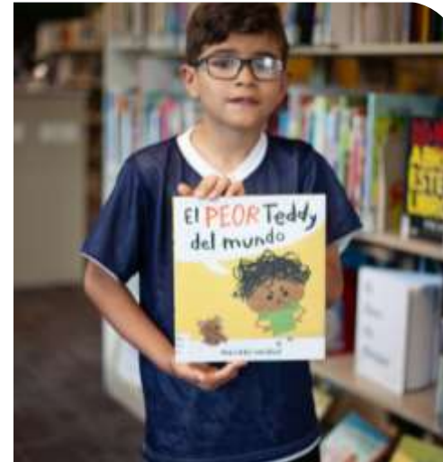
Equal Access Champion