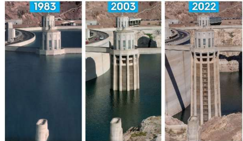
Lake Mead Water Levels