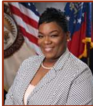
Councilwoman Latresa Akins-Wells (Ward 4)