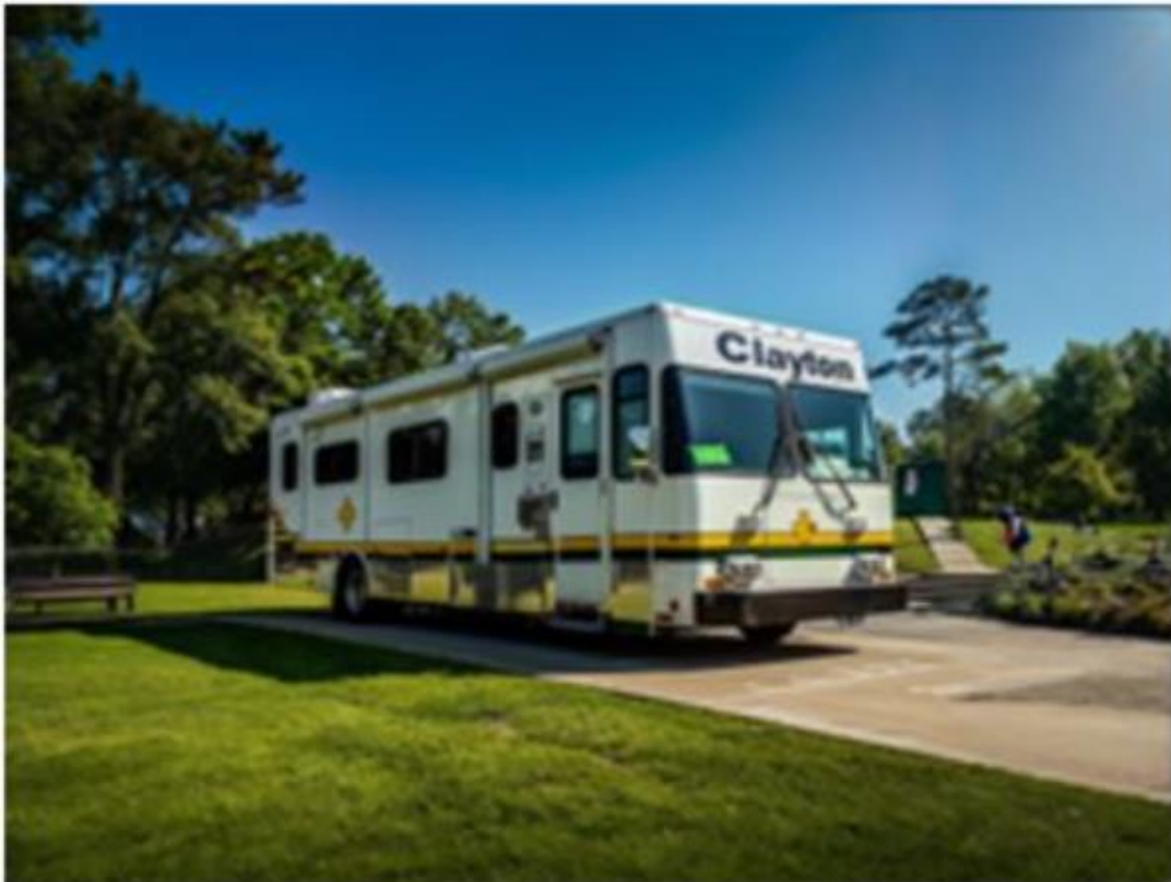
Example: Mobile Medical Unit